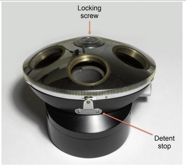
Figure 2: Nosepiece with turret, the latter facing upwards